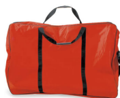
890-001 Carrying case for vacuum mattress