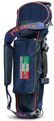
12072/BR "COVER OX 5 BR"- professional cylinder holder for 5 lt oxygen bottles