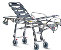
Frog 7240 PROOF "FROG PLUS" self loading stretcher with trendelenburg certified