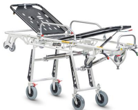
Frog Lite 7260 PROOF "FROG LITE" self loading aluminium stretcher with trendelenburg certified