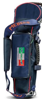
12072/BR "COVER OX 5 BR"- professional cylinder holder for 5 lt oxygen bottles