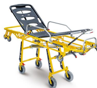
Frog 7210 "FROG" yellow self loading stretcher with trendelenburg