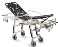
7265 Proof Aluminium self loading stretcher "Frog lite Advance" with extractable handles and Trendelenburg