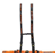
612/AN-2/MEB Adjustable thoracic abdominal belt orange/black with MeBer band and 4 points fastening for self loading stretchers and sedan chairs