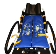
12154 "BEAR PODS" Bariatric containment system for self-loading stretchers