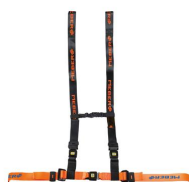
612/AN-2/MEB Adjustable thoracic abdominal belt orange/black with MeBer band and 4 points fastening for self loading stretchers and sedan chairs