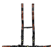
612/N-2/MEB Adjustable thoracic abdominal belt black with MeBer band with 4 points fastening for self loading stretchers and sedan chairs