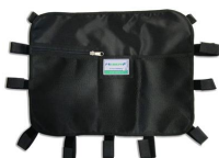
12025 Black multi usage object holder for automatic loading stretcher