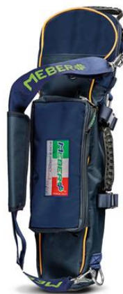
12072/BG "COVER OX 5 BG"- professional cylinder holder for 5 lt oxygen bottles