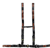
612/N-2/MEB Adjustable thoracic abdominal belt black with MeBer band with 4 points fastening for self loading stretchers and sedan chairs