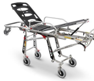
Mercury 7072/4RG PROOF Certified stainless steel variable height stretcher high version with 4 rotating wheels