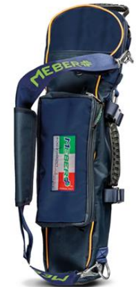
12072/BG "COVER OX 5 BG"- professional cylinder holder for 5 lt oxygen bottles