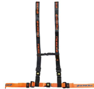
612/AN-2/MEB Adjustable thoracic abdominal belt orange/black with MeBer band and 4 points fastening for self loading stretchers and sedan chairs