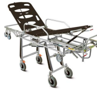
Frog 7240 PROOF "FROG PLUS" self loading stretcher with trendelenburg certified