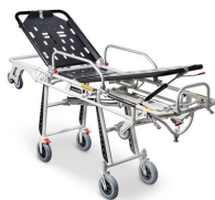
Frog Lite 7260 PROOF "FROG LITE" self loading aluminium stretcher with trendelenburg certified