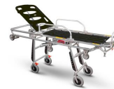
MBS-01 MEBER BARIATRIC STRETCHER 7270 Self loading stretcher for bariatric transport