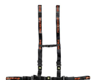
612/N-2/MEB Adjustable thoracic abdominal belt black with MeBer band with 4 points fastening for self loading stretchers and sedan chairs