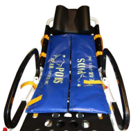
12154 "BEAR PODS" Bariatric containment system for self-loading stretchers