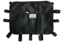
12025 Black multi usage object holder for automatic loading stretcher