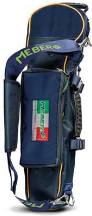
12072/BG "COVER OX 5 BG"- professional cylinder holder for 5 lt oxygen bottles

Adjustable thoracic abdominal belt black with MeBer band with 4 points fastening for self loading stretchers and sedan chairs