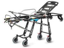
Mercury EL 7092 PROOF Certified self-loading stretcher