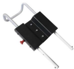
12128 Adjustable system for headrest of Meber-X and Mercury stretchers