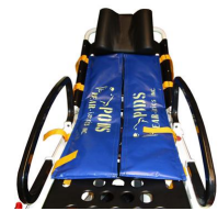
12154 "BEAR PODS" Bariatric containment system for self-loading stretchers