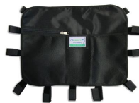
12025 Black multi usage object holder for automatic loading stretcher