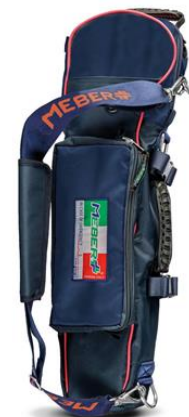
12072/BR "COVER OX 5 BR"- professional cylinder holder for 5 lt oxygen bottles