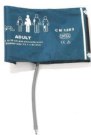
8540-002 27-35 cm adult cuff