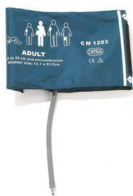
8540-002 27-35 cm adult cuff