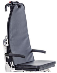
12118 Mattress for Extra and Ergolift chairs' transformation kit into fixed chairs