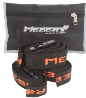
566 Black bag with 3 belts in 2 pieces made of black ribbon with orange MeBer logo for Extra chairs