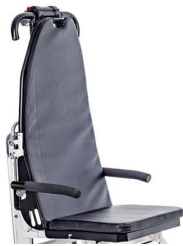
12118 Mattress for Extra and Ergolift chairs' transformation kit into fixed chairs