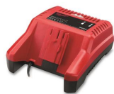
12090 Battery charger MILWAUKEE M28C for rechargeable battery M28 RED Extra Ergolift chair