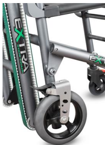
670-004 Castor with brake diam. 200 mm for Extra chair