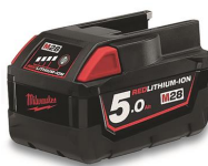
12092 Battery MILWAUKEE M28 RED 5,0 Ampere for Extra Ergolift chair