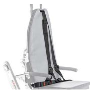
610 Thoracic-abdominal belt with four fastening for padded chair