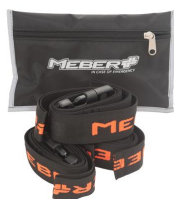
566 Black bag with 3 belts in 2 pieces made of black ribbon with orange MeBer logo for Extra chairs