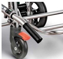
1711 Removable left lever with ergonomic handle for Extra chairs.