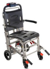
Extra Ergolift 671 Powered stair chair