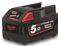
12092 Battery MILWAUKEE M28 RED 5,0 Ampere for Extra Ergolift chair