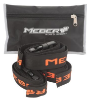
566 Black bag with 3 belts in 2 pieces made of black ribbon with orange MeBer logo for Extra chairs