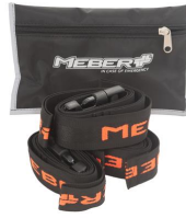
566 Black bag with 3 belts in 2 pieces made of black ribbon with orange MeBer logo for Extra chairs