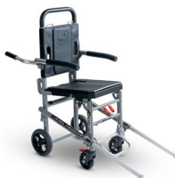
679 Narrow foldable sedan chair