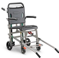
Extra 670/BR Track assisted stair chair with arms