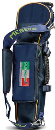
12072/BG "COVER OX 5 BG"- professional cylinder holder for 5 lt oxygen bottles