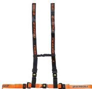
612/AN-2/MEB Adjustable thoracic abdominal belt orange/black with MeBer band and 4 points fastening for self loading stretchers and sedan chairs