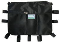
12025 Black multi usage object holder for automatic loading stretcher