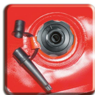
894-001 Aspiration valve for vacuum splints and mattress