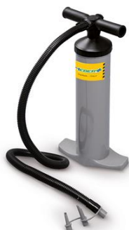
896/DF Abs aspiration pump