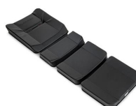
7002 Electrowelded 4 pcs black mattress for stretchers