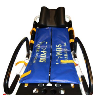
12154 "BEAR PODS" Bariatric containment system for self-loading stretchers