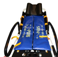
12154 "BEAR PODS" Bariatric containment system for self-loading stretchers