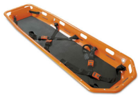
Toboga 16100 Stretcher with straps and foot rest