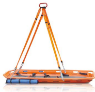
16100-005 Certified lifting sling for Toboga stretchers