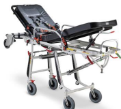
Mercury Lite Cinque 7095/4RG Proof Certified aluminium 5 levels self-loading stretcher with 4 swivel wheels