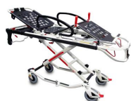
MeBer-X 7300 "MeBer-X" Multi-level stretcher complete with mattress and belts