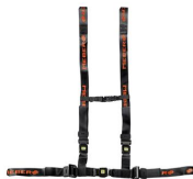
612/N-2/MEB Adjustable thoracic abdominal belt black with MeBer band with 4 points fastening for self loading stretchers and sedan chairs