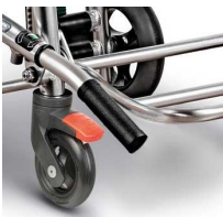
171J Removable left lever with ergonomic handle for Extra chairs.