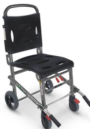
678 Extra Lite Basic Extra Lite Basic, foldable carrying chair