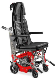
Extra Ergolift FX 675 Fixed frame powered Stair Chair suitable for transportation