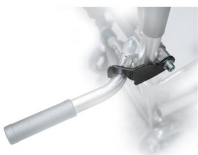
842L Zena rear levers locking kit