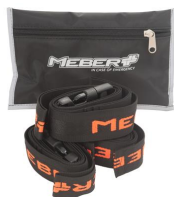
566 Black bag with 3 belts in 2 pieces made of black ribbon with orange MeBer logo for Extra chairs