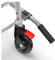
172J Removable right lever with ergonomic handle for Extra chairs