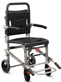
Extra Lite Standard 676 Foldable carrying chair with 4 wheels, footrest and arms