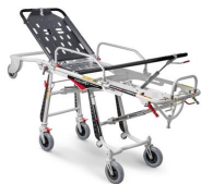
Mercury Lite 7080/4RG Proof Ambulance cot in aluminium with variable height and four swivel castors