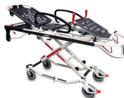
MeBer-X 7300 "MeBer-X" Multi-level stretcher complete with mattress and belts