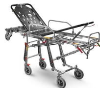
Mercury Cinque 7075/4RG PROOF Certified 5 levels self-loading stretcher with 4 swivel wheels