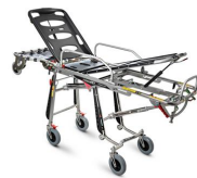
Mercury 7070/4RG PROOF Stainless steel variable height stretcher certified with 4 rotating wheels