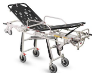
7265 Proof Aluminium self loading stretcher "Frog lite Advance" with extractable handles and Trendelenburg